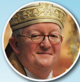
Most Rev. Bernard Longley Archbishop of Birmingham